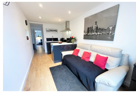
First Floor Area: 23.9 m<sup>2</sup> ... 258 ft<sup>2</sup>

Bedroom 4.06 x 2.66m 13'4" x 8'9" Shower Room Bedroom 3.30 x 2.37m 10'10" x 7'9"